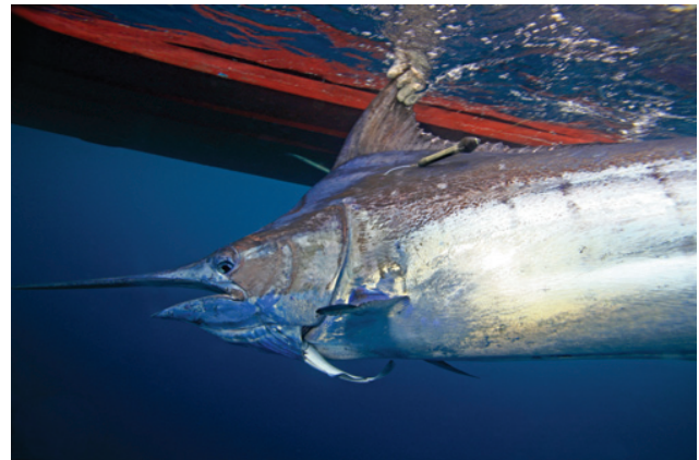
Figure 1 | Blue marlin M. nigricans with an electronic tag used to monitor horizontal and vertical habitat use. As one of the largest teleosts in the Atlantic that grows to nearly 1,000 kg, this high-oxygen-demand tropical pelagic fish requires dissolved oxygen levels \geq 3.5 \text{ ml l}^{-1} .

Large-scale expansion of OMZs over the past 50 years 3 poses a challenge for predicting impacts to pelagic fish stocks and their ecosystem. Although oceanographic modelling and ocean observations for retrospective analyses are useful for examining past trends, understanding future OMZ expansions and the concurrent impacts on billfish and tuna populations is essential for preventing overfishing. We analysed recent hypoxia data associated with OMZ expansion in the eastern tropical Atlantic (ETA) to examine possible habitat loss of the near-surface layer. We also present vertical habitat use data of Atlantic blue marlin ( Makaira nigricans ) monitored with electronic tags (Fig. 1). Changes in habitat use were validated by maximum daily depths